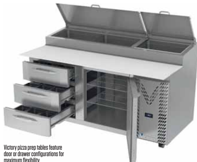
Victory pizza prep tables feature door or drawer configurations for maximum flexibility

Further information victoryrefrigeration.com