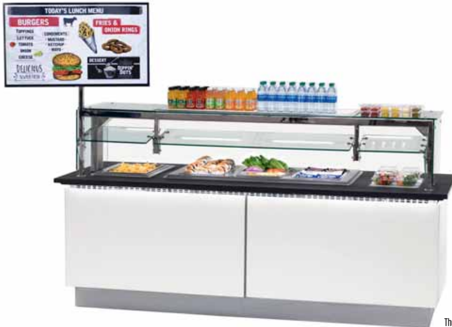
The Duke HotColdFreeze™ is flexible and versatile. The units are customizable

tailored solutions that raise profits, increase ROI, drive efficiencies, and enhance quality.