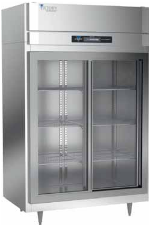
The Ultraspec line of refrigerators and freezers combines function and style

Additionally, electronic lock models are available for unmanned applications. With modern looks, functions and features, these display models bring refrigeration to the front and center.