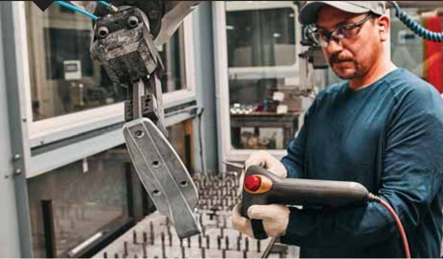
Left: The program on one of Kason's 13 robots is fine tuned. Below: The original five-and-dime store in Brooklyn, New York, that was the start of Kason Industries