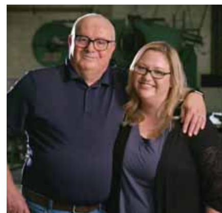
Top: All Atlas products are crafted in Miami, Florida, just like this INFINITI FIT 4-Cart Combination modular serving line

In addition to making industry leading drop-ins, we make a wide range of serving lines that will fit whatever you need. We have high-quality modular options and no two of our custom INFINITI lines are the same, creating a line as unique as the operations they go into.