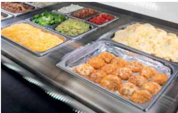
Duke's customized solutions also optimize and integrate workflow from start to finish

Our dedicated 700,000 sq ft of manufacturing space and global sales and distribution facilities are ready to work on your unique challenge. We always look at problems from your perspective and then work with your team to create