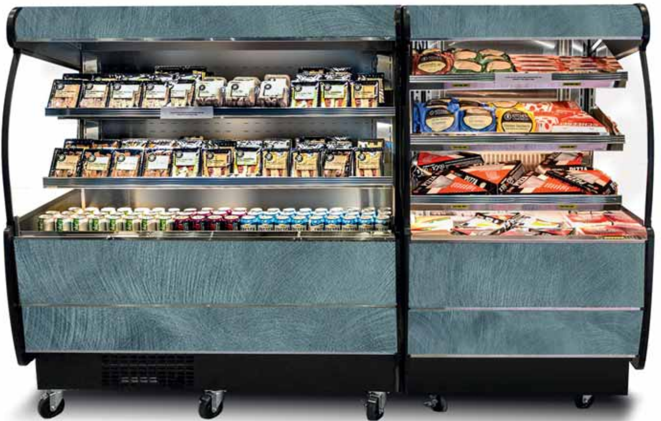
High Profile Refrigerated Merchandiser paired with Heated Merchandiser for a seamless look, customized to match any décor

Federal is proud to work with its customers to offer innovative and customized products, backed up with the experience of 100 years of manufacturing