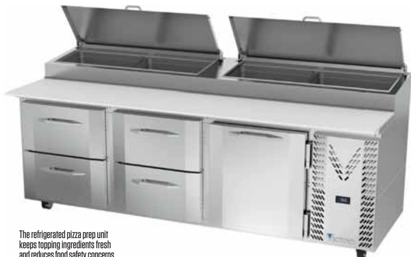
The refrigerated pizza prep unit keeps topping ingredients fresh and reduces food safety concerns