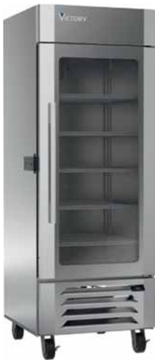
Victory's display merchandisers offer flexibility and convenience for today's market

With today's ever-evolving market, flexibility and convenience are more important than ever. That's where Victory's display merchandisers come in to play. Combining elegance and function, these display refrigerators and freezers